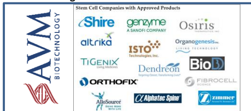
Safety and Efficacy Trials of AugmenStem™

There are now 14 FDA approved adult stem cell products (see figure below) and over 450 clinical trials going on world wide, compared to under 10 clinical trials using aborted fetal or embryonic stem cells ( www.clinicaltrials.gov ). To maintain this preference so heavily towards safer, more effective and affordable adult stem cells, we need to make sure that adult stem cells work their very best. AVM Biotechnology has a lead molecule that does just that. Trials in horses are yielding exciting results and human clinical trials are coming soon. Trials in horses indicate that AVM Biotechnology's drug can increase regenerative healing rates and eliminate the need for repeated stem cell injections. Now that's exciting!